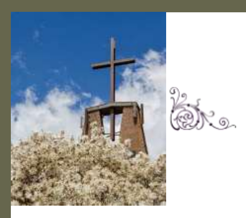
837 Charles Street Torrington, CT 06790